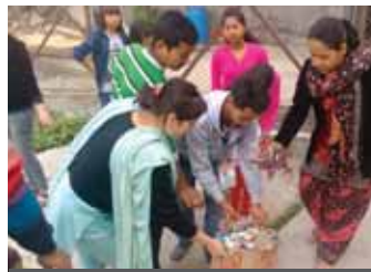
Cleaning drive by NYKS youth at Gangtok, 2014

Each travelling edition has a thematic focus for deliberation at the state levels. Some of the issues that have been discussed are biodiversity in Sikkim, River Yamuna, etc.