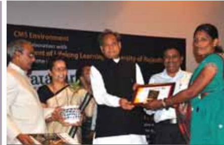
Mr Ashok Gehlot, former CM of Rajasthan at Jaipur, 2012

Participation of Head of states/ UTs, practitioners, local communities etc. has garnered more media attention.