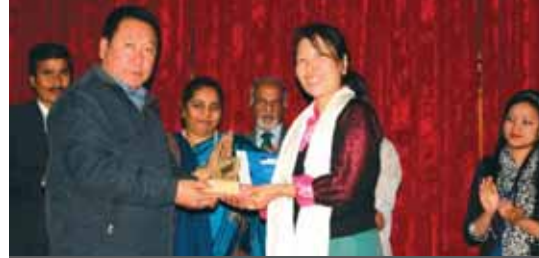
Sikkim Govt- Forest Minister Mr Lepcha felicitates Green Ambassador award, 2014

CMS VATAVARAN awards the Green Ambassador title to an individual for their conservation work in an identified theme with an objective to recognize the efforts of local conservationists.