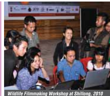
Wildlife Filmmaking Workshop at Shillong, 2010

Curated workshop on environment and wildlife filmmaking are organized for students in partnership with media/ filmmaking institutes